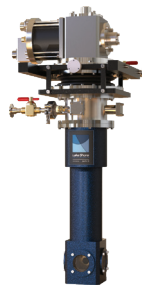
CCS-XG <4 K to 325 K