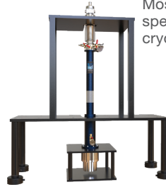
CCS-800 <4.5 K to 300 K