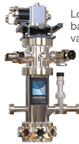
CCS-XG-UHV <4 K to 325 K

Low-vibration, bakeable, ultra-high vacuum cryostat