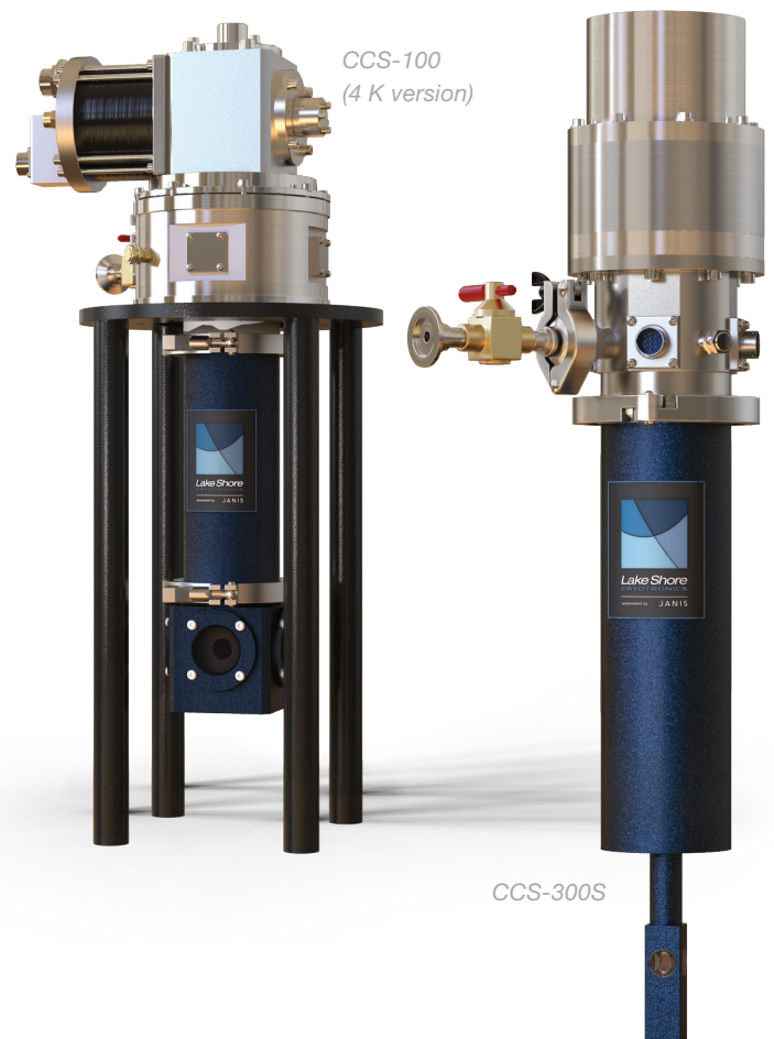
CCS-100 (4 K version)

The Lake Shore M81-SSM provides highly synchronized DC, 100 kHz AC, and mixed DC + AC sourcing and measuring—including both voltage and current lock-in measurement capabilities—for low-temperature material research performed in your cryostat. It supports up to three remote-mountable source and three measure modules per a single M81-SSM-6 instrument and, owing to its modularity, allows signal and source amplifiers to be located as close as possible to the sample being characterized. This minimizes the signal wiring to the sample, reduces noise, and increases measurement sensitivity.